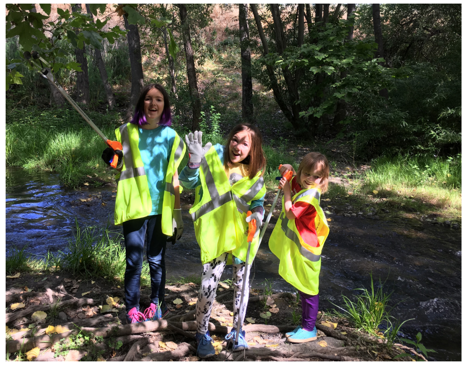
The Ditzler Girls looking fabulous creekside.

If you missed the cleanup, mark your calendar now for the next one, on Saturday, September 15!