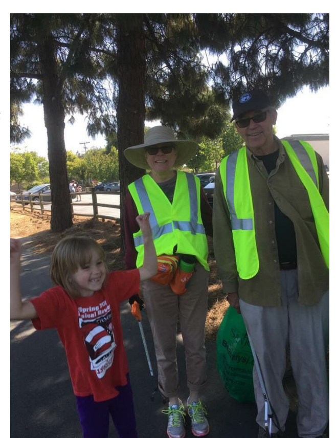
The Roberts witness unbridled and infectious enthusiasm.